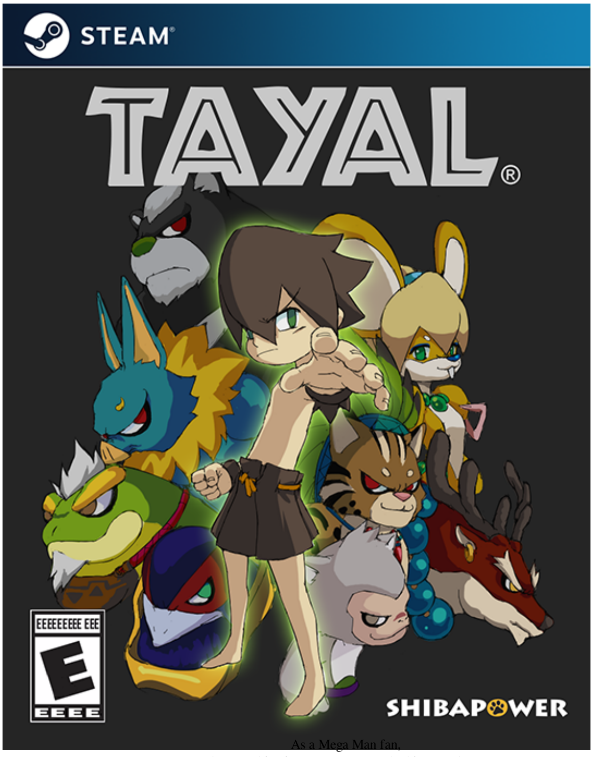
I do everything in my power to made this game better. Hopefully you will like this little fan game.